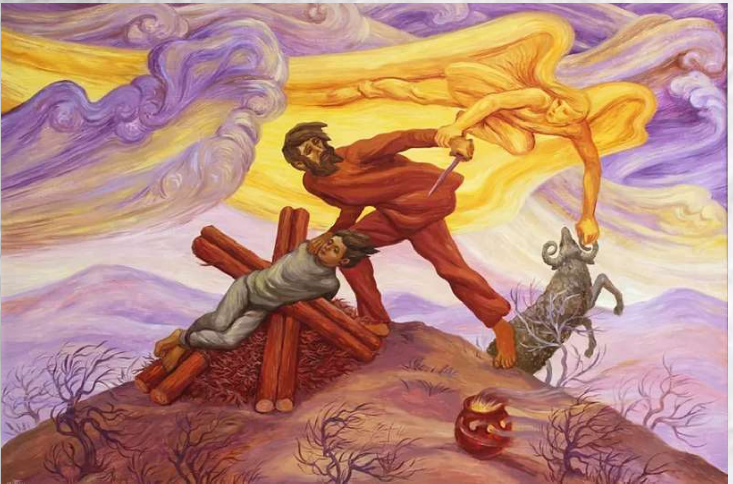
Peter Koenig, Abraham's Sacrifice , 1970.